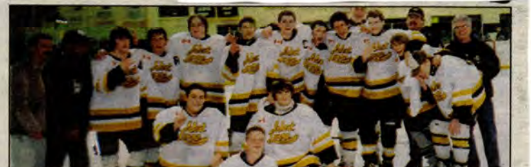
West Lorne Midget end season on a high