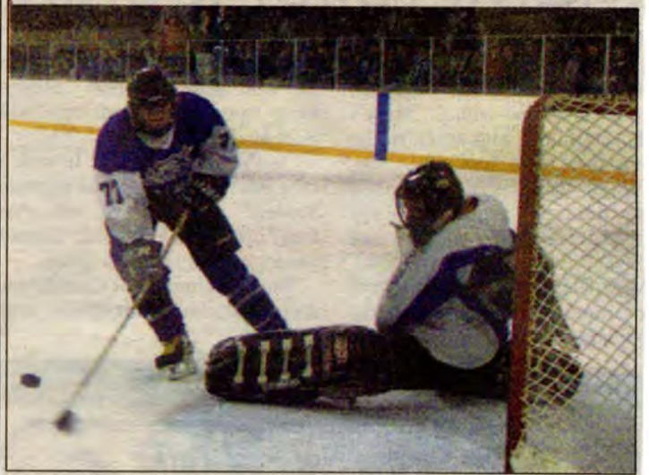
Wildcats beat Alumni