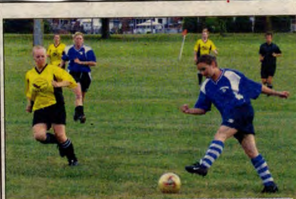
Ladies' win in the rain