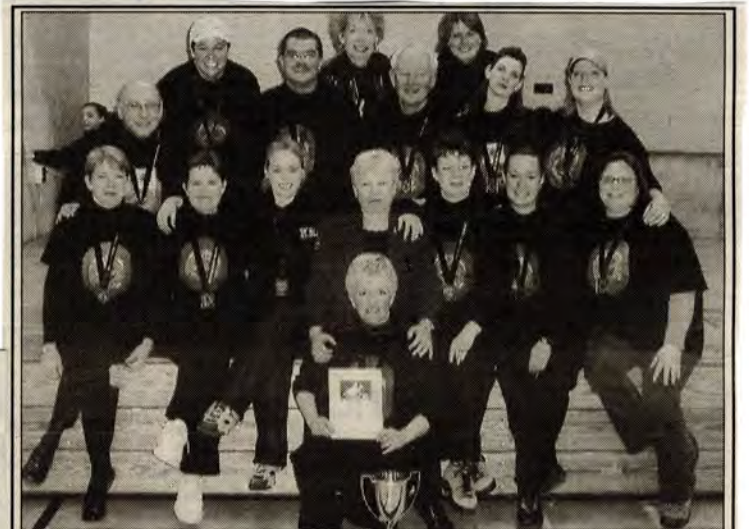
A-T Choppers coming to West Lorne